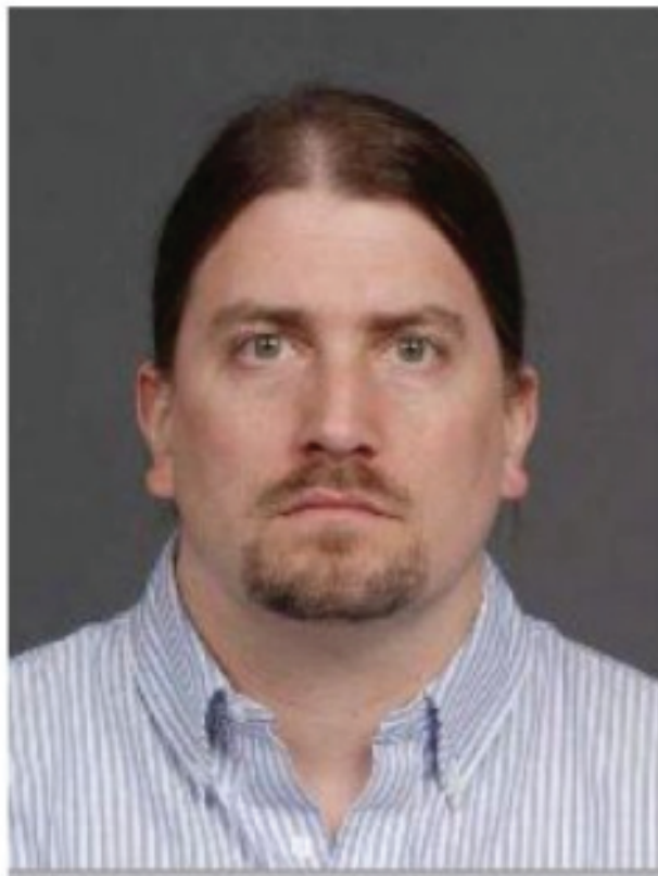
Figure 24: A facial template and example of "Head and Shoulders" scene constraints

The photo must be taken at the same time your prints are taken by the technician who is rolling the fingerprints. There are Binary Biometrics regional offices available across the country and internationally which are capable of completing the photo and hard card fingerprinting option for you. Please contact our office at 1-855-722-6695 or at info@binarybiometrics.com to find the closest regional partner to you. If there is not a location near you, you may request a local precinct or Livescan Provider to take the photo for you using the specifications below: